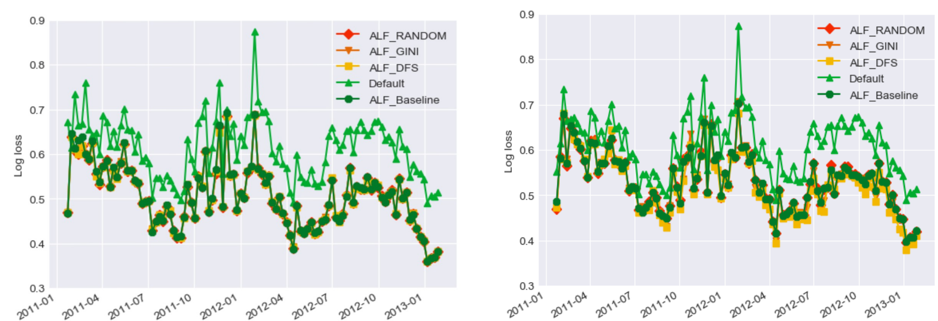
Performance comparison of models with 500 (right) and 1000(left) model features